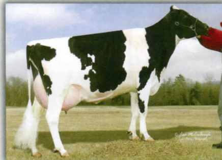
OVALTOP TALENT ROXETTE (2E-92) 6-07 2x 320 33,699 3.7 1242 3.3 980 7-07 2x 295 29,648 3.8 1127 3.3 988 8-07 2x 365 36,177 3.8 1384 3.1 1104 Daughters by Advent, Atwood, Armani, & Phoenix