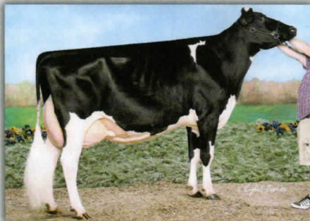
OVALTOP GIBSOM NAOMI (EX-93) 2-05 2x 330 22,359 3.8 845 3.1 750 3-05 2x 364 27,932 3.5 967 3.3 924