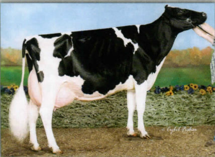
OVALTOP DUNDEE ESTER (2E-94) 4-04 2x 314 30,625 3.8 1161 3.0 931 5-04 2x 313 29,567 4.1 1215 2.9 846 6-03 2x 365 31,554 3.6 1138 2.9 921 Daughters by Fever & Goldwyn